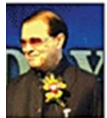
- RC Laloo, Deputy CM

Unless school dropout children are brought back to school, we will not be able to give a literacy mandate"